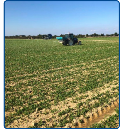
Spreading Magnesium Nitrate