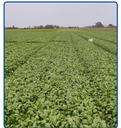
Field site at harvest