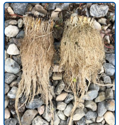
Left: Grower standard; Right: Surety