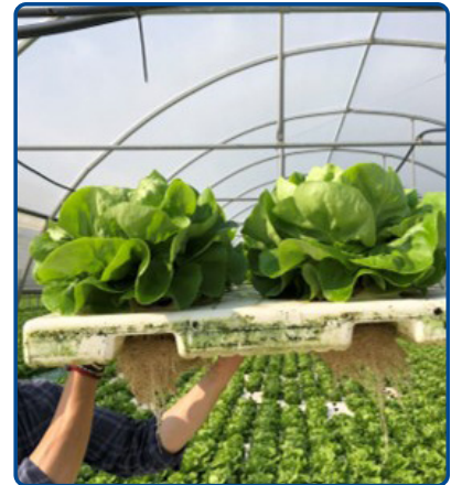
Lettuce treated with Surety