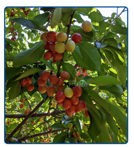
Cherries in a similar trial