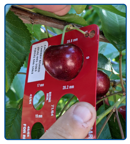
Cherries in a similar trial