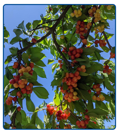
Cherries in a similar trial